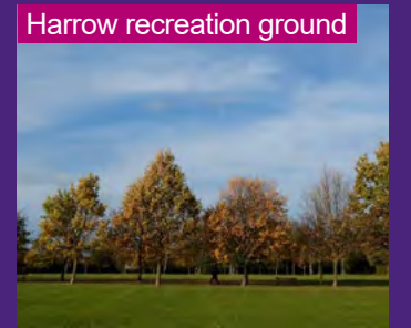
Harrow recreation ground