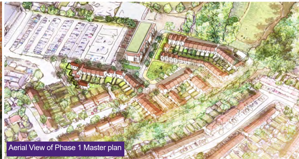
Aerial View of Phase 1 Master plan