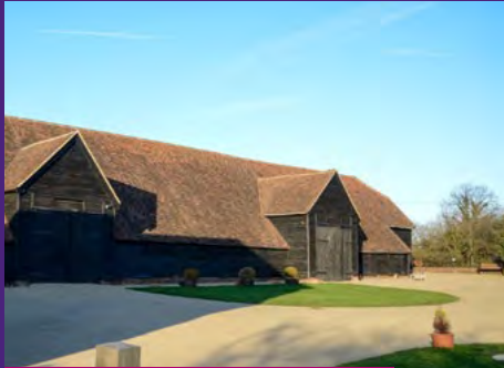
The Great Barn at Headstone