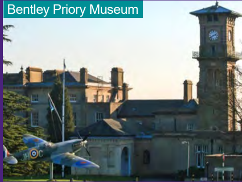
Bentley Priory Museum