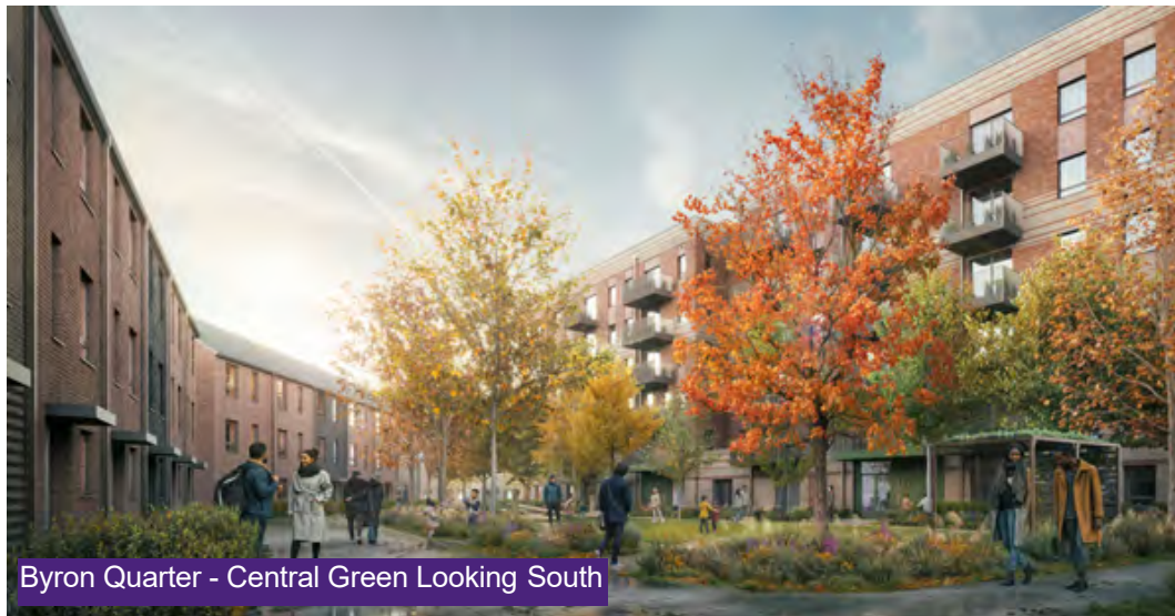
Byron Quarter - Central Green Looking South