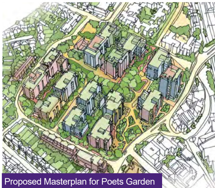
Proposed Masterplan for Poets Garden