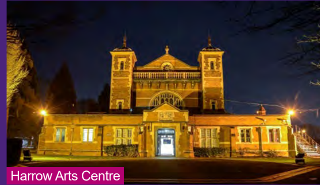
Harrow Arts Centre