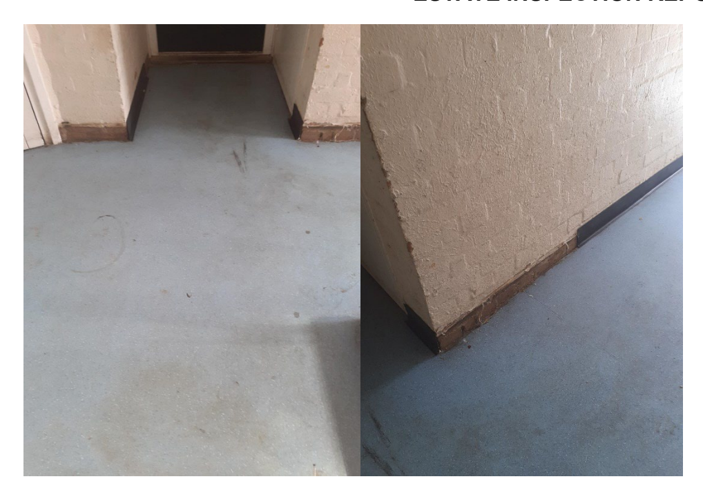
Lower Rd – Skirtings board missing in areas