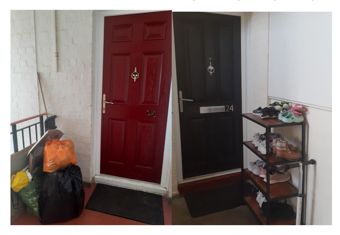
Items outside Lower Rd