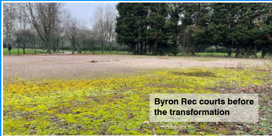
Byron Rec courts before the transformation

opportunity to get involved in friendly and social local competitions.