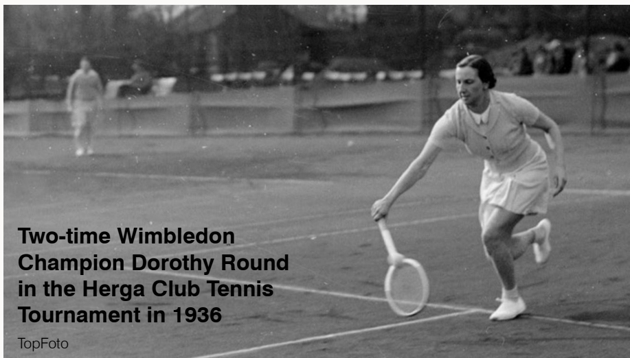
Two-time Wimbledon Champion Dorothy Round in the Herga Club Tennis Tournament in 1936