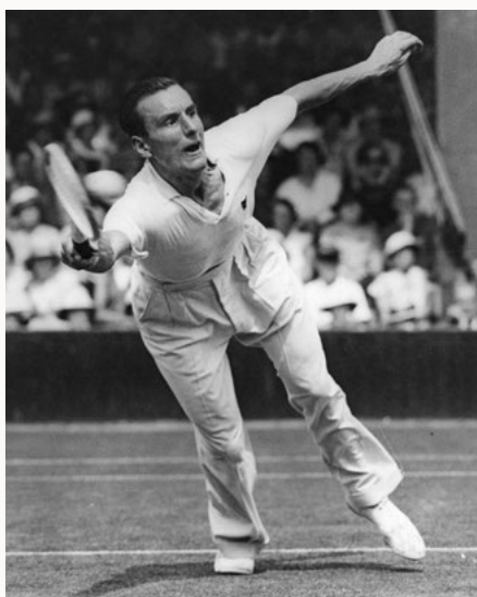
Fred Perry started his career playing at the Herga Club

She's committed to bringing the collection closer to the people of Harrow and works with a band of volunteers