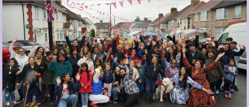
St Margaret's Avenue