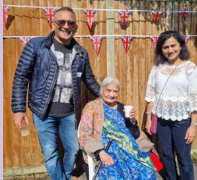
White Craig Close