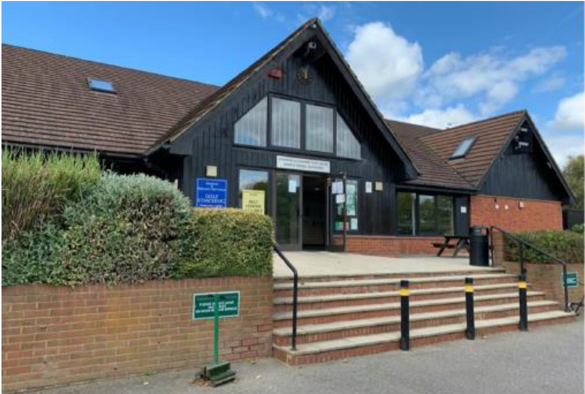
Figure 1: Entrance to clubhouse building