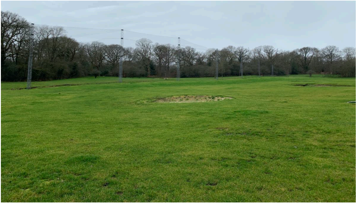
Figure 3: View of driving range