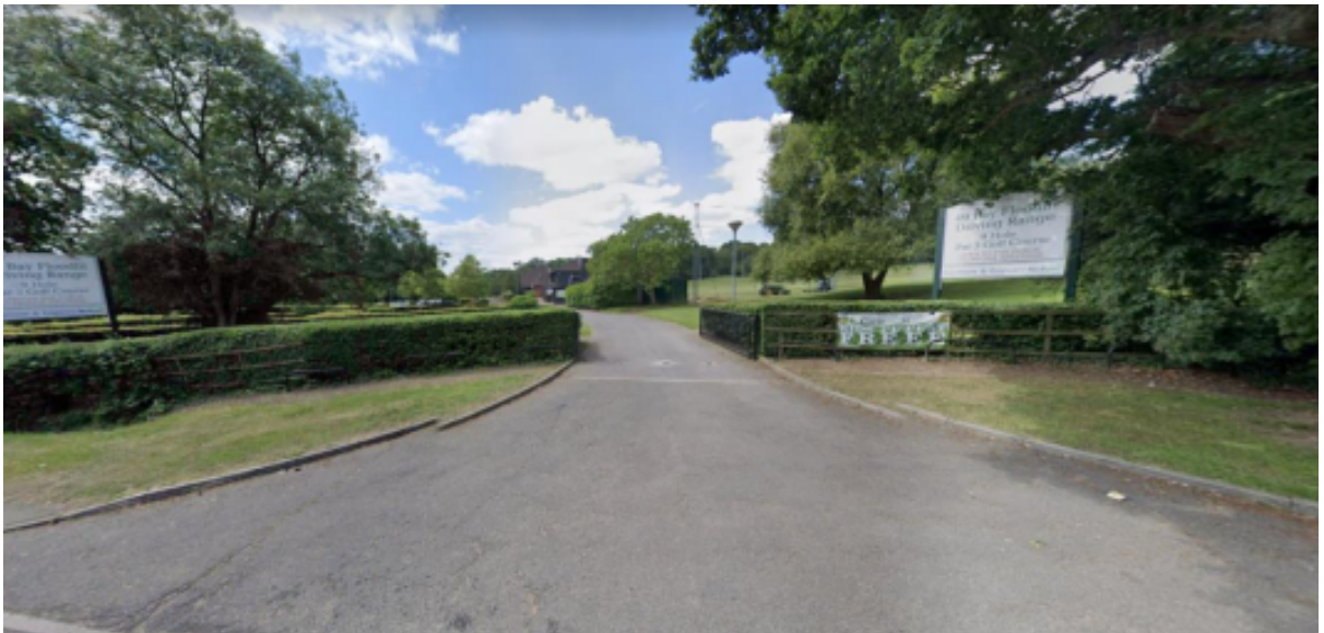
Figure 4: Entrance to site