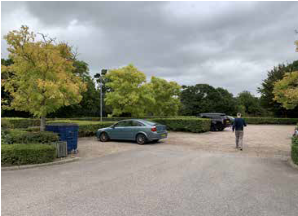
Figure 5: Car park