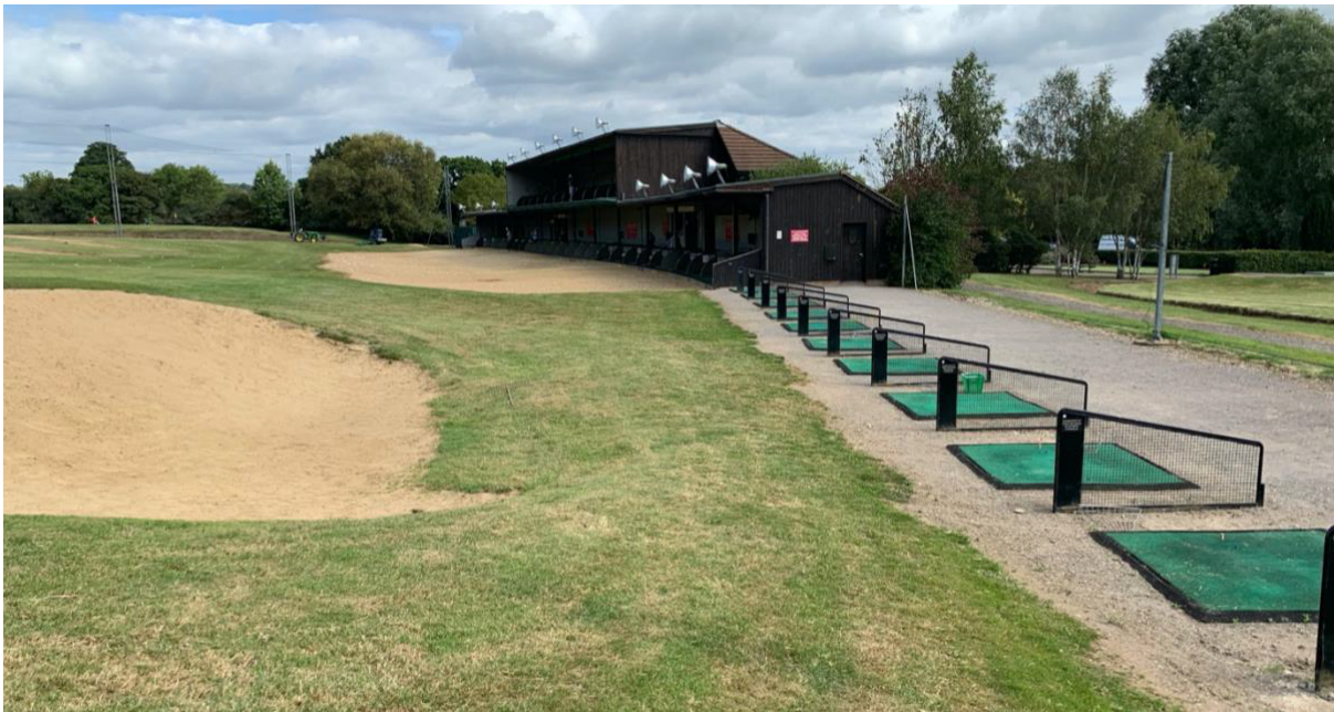
Figure 2: View of golfing green and clubhouse building from the rear