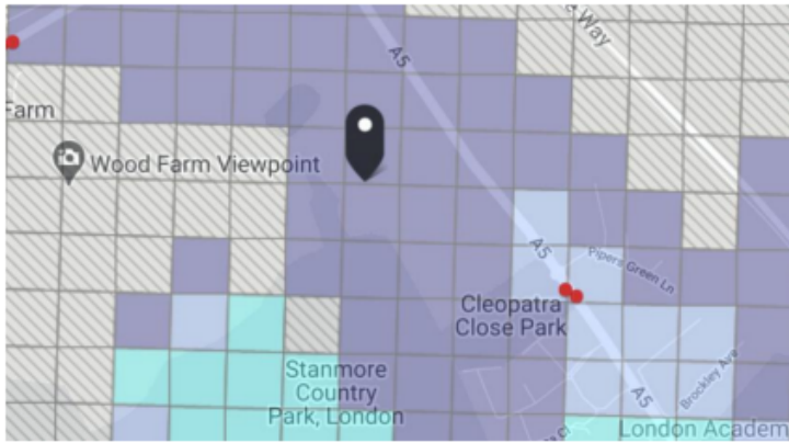
Figure 3: Extract from TfL Planning Information Database

2.17 The Appeal Site has a PTAL rating of 1a (see Figure 3). The nearest bus stop to the site is located to the south on Brockley Hill, approximately 300m away. The bus stops are served by the 107 bus service between New Barnet and Edgware via Elstree and Borehamwood. The site is located some 1,500m when travelling on foot or in a vehicle from Stanmore Tube Station which provides regular services on the Jubilee Line into Central London with an interchange at Wembley Park.