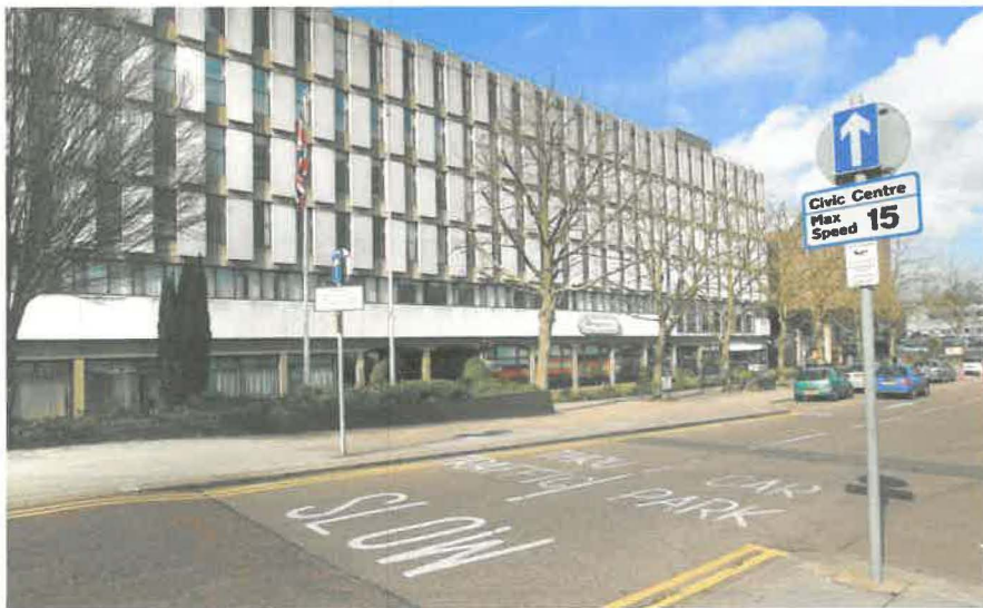
The Civic Centre