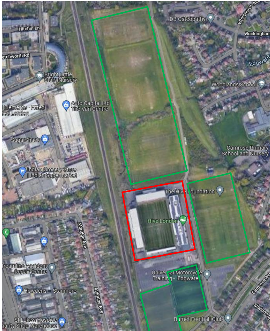
Figure 1: Aerial view of The Hive grounds (green=football pitches, red=stadium)