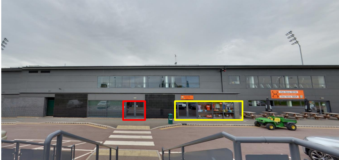
Figure 7: Images of the shared corridor on the first floor (top image) and ground floor lobby (bottom image) at The Hive (red=direction to Amber Suite, yellow=direction to gym, meeting rooms and other uses)