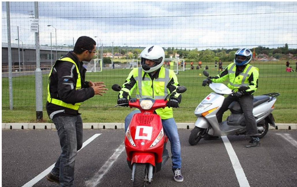
Figure 4: Image of the Universal Motorcycle Training driving school at the Hive

3.15 Figures 4 and 5 show the range of different uses in operation, including images of these taking place at the same time as weddings.