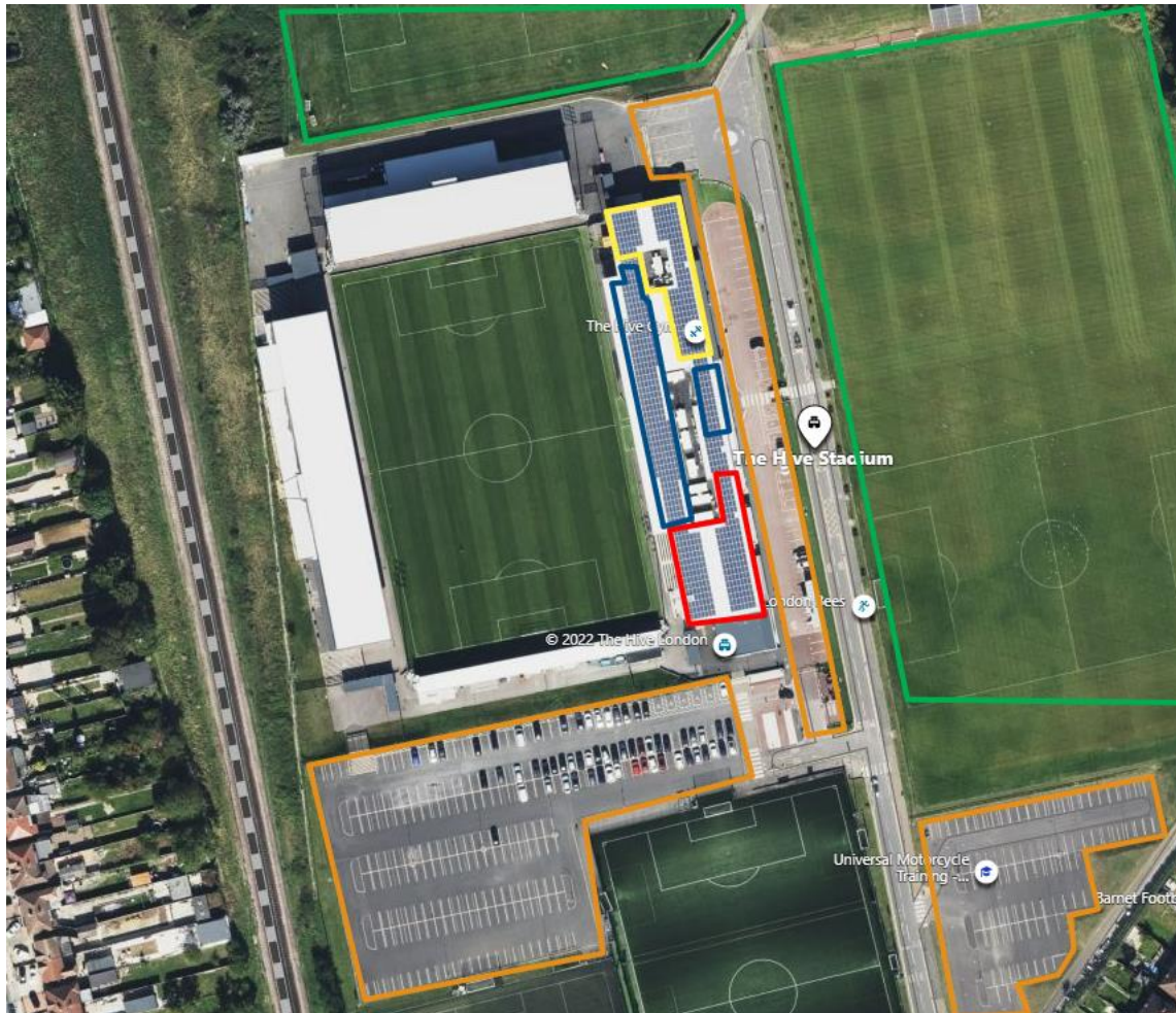
Figure 2: Aerial view of The Hive Stadium (First Floor Uses: red=Amber Suite, blue=offices and meeting rooms, yellow=gym, green=football pitches, orange=car park)

Source: Bing Maps 8 ; Turley coding added