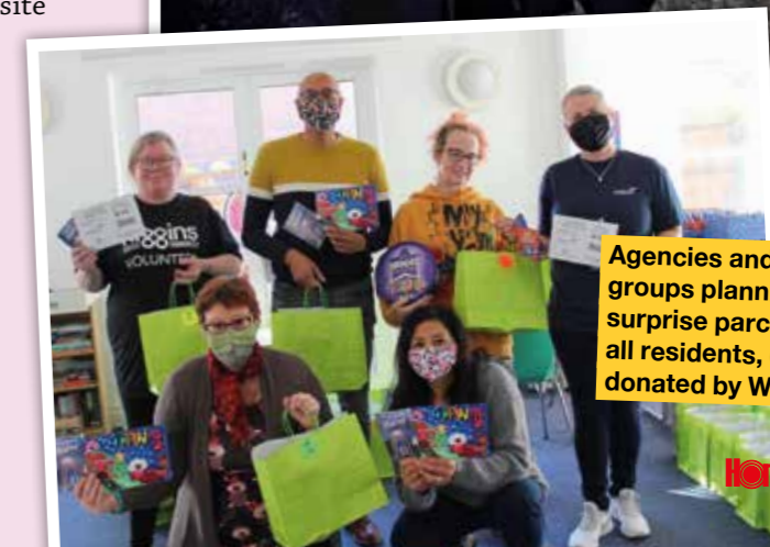
Agencies and volunteer groups planning surprise parcels for all residents, chocs donated by Wates