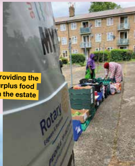
MyYard providing the weekly surplus food market on the estate