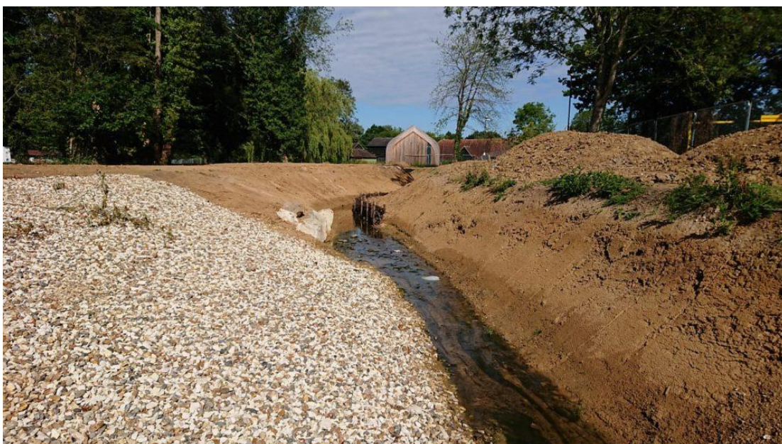
Figure 3 Headstone Manor (Flood Alleviation Scheme)

2.6 The table below shows CIL funding which has been allocated during the current financial year (or previous year) but has not yet been spent.