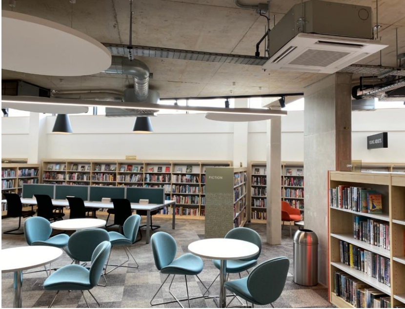
Figure 4 New Greenhill (Harrow Town Centre) Library