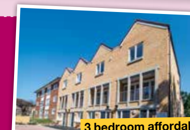
3 bedroom affordable homes at Chichester Court

12 families moved into their new homes in September as part of the Chichester Court development scheme. The remaining 14 homes will be available by the end of the year. Following the final homes being completed the contractor will finish the roadway and pavement and finalise some parking spaces. Residents could choose some social value outcomes, and chose to have picnic tables and benches and some trees and plants – thank you Bugler. This is another example of building on small, underused parcels of housing land to provide much needed homes at affordable rent.