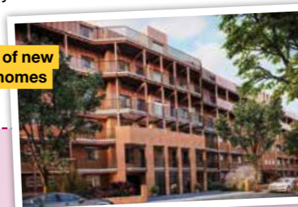
Drawing of new rooftop homes

The London Borough of Harrow has approved an 'airspace' project for affordable homes at the Berridge Estate in Edgware, in partnership with developer Apex Airspace, where they will build 48 rooftop homes on top of the existing 3 storey block. The new homes will be acquired and managed by the council.