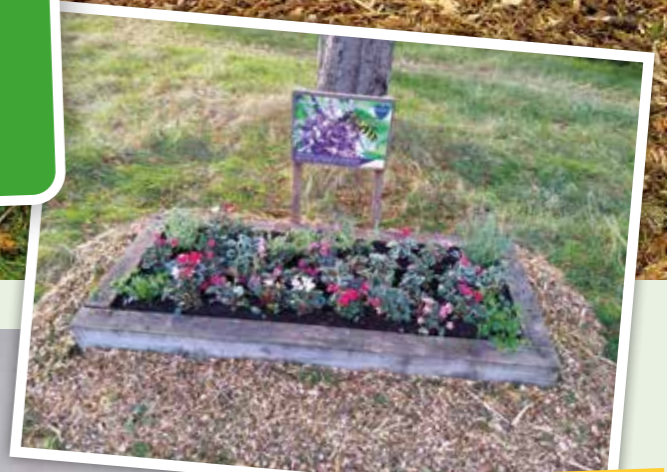
Raised beds planted with donated plants from residents

The journey has been long and quite difficult at times, but the estate in Pinner has been transformed this year from a green wasteland, to a haven with pockets of wildlife friendly meadows, garden beds for residents to grow their own vegetables, but most importantly a wonderful community space. The grant from Near Neighbours has helped the estate to be transformed from blocks of flats with green space of little value to wildlife, to a buzzing and flowering oasis for pollinators, mammals and birds. We even managed to build a wildlife friendly pond.