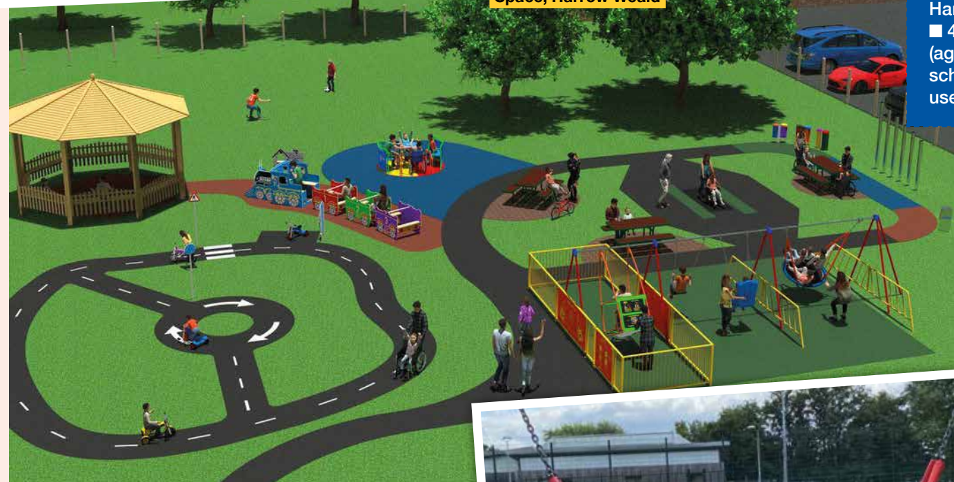
Vision for Cedars Park Open Space, Harrow Weald