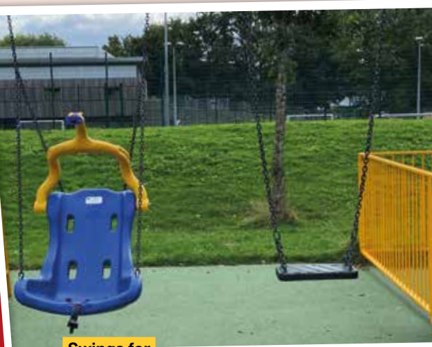
Swings for everyone