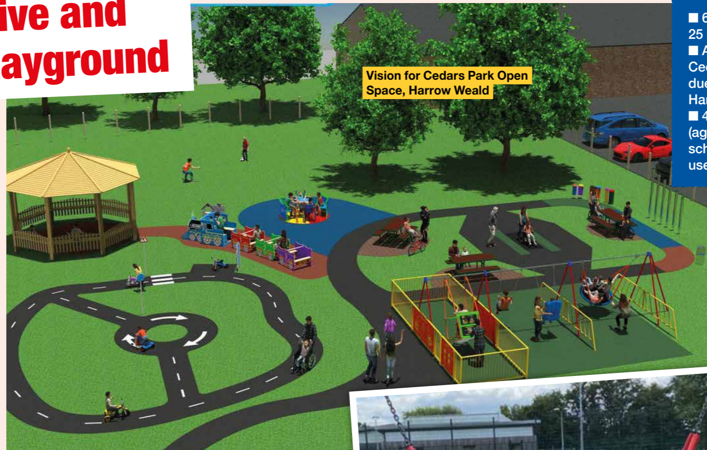
Vision for Cedars Park Open Space, Harrow Weald