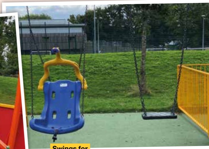
Swings for everyone