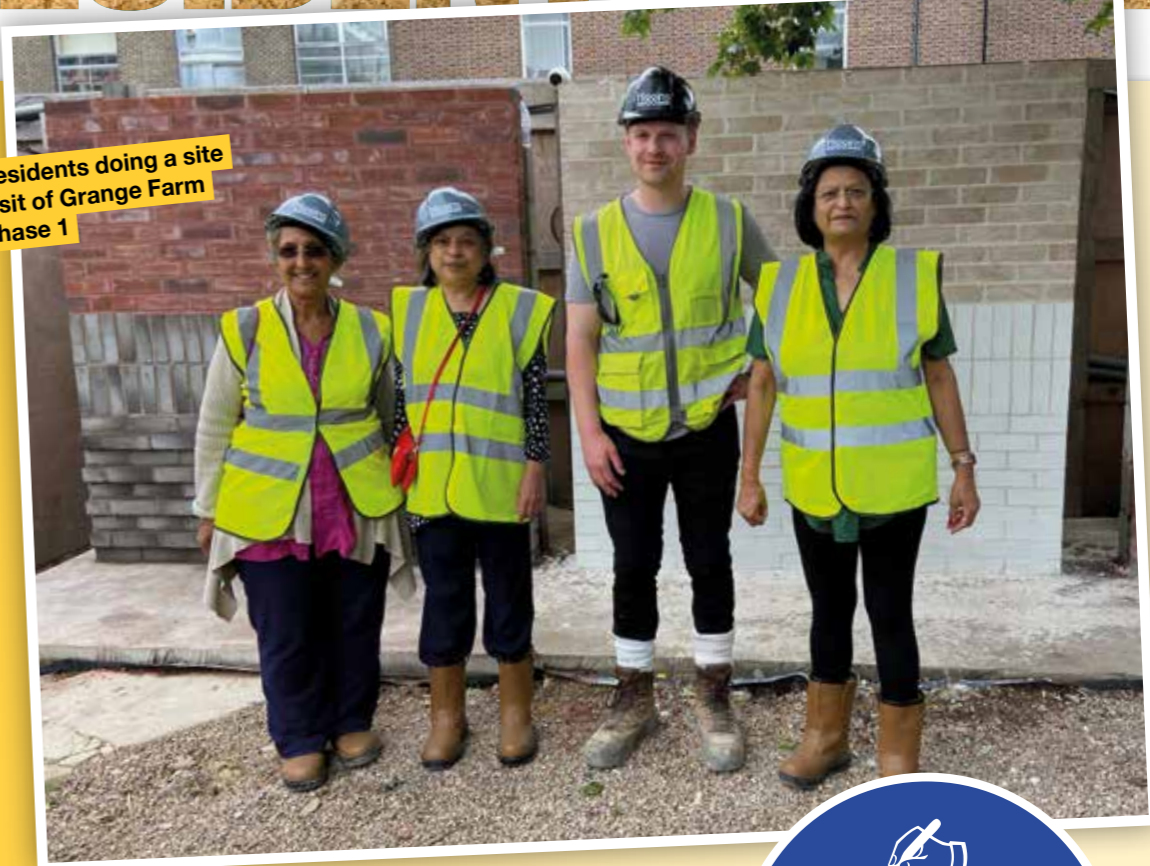
Residents doing a site visit of Grange Farm phase 1