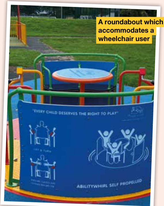
A roundabout which accommodates a wheelchair user

Other equipment includes wheelchair trampoline and a roundabout. Phase 2 will include a bike track/roundabout and a gazebo for families to get together, and this is due in 2022.