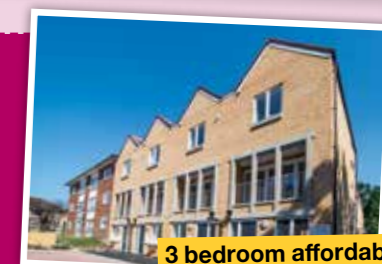
3 bedroom affordable homes at Chichester Court

12 families moved into their new homes in September as part of the Chichester Court development scheme. The remaining 14 homes will be available by the end of the year. Following the final homes being completed the contractor will finish the roadway and pavement and finalise some parking spaces. Residents could choose some social value outcomes, and chose to have picnic tables and benches and some trees and plants – thank you Bugler. This is another example of building on small, underused parcels of housing land to provide much needed homes at affordable rent.