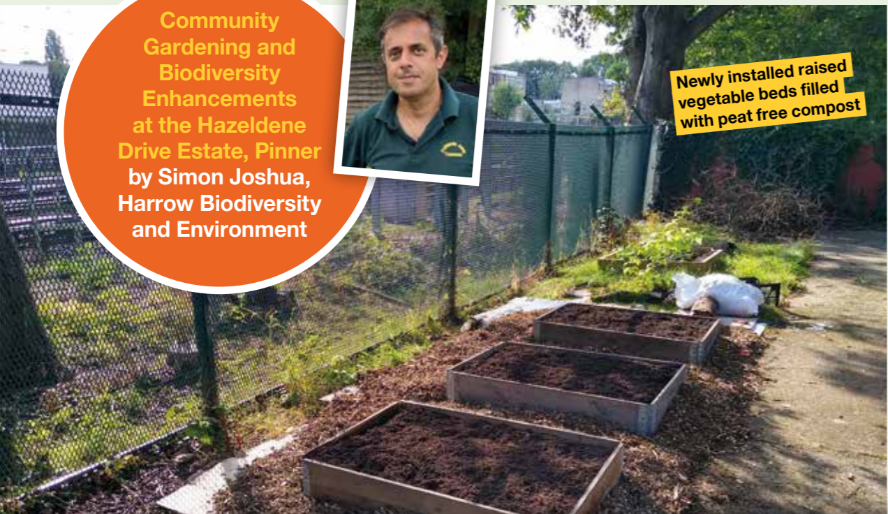
Newly installed raised vegetable beds filled with peat free compost