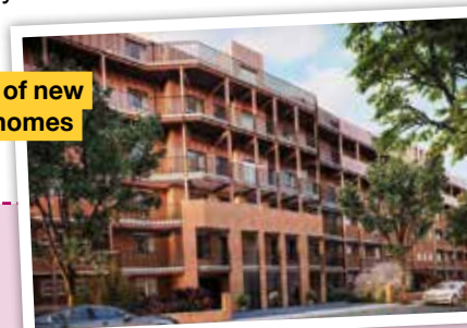
Drawing of new rooftop homes

The London Borough of Harrow has approved an 'airspace' project for affordable homes at the Berridge Estate in Edgware, in partnership with developer Apex Airspace, where they will build 48 rooftop homes on top of the existing 3 storey block. The new homes will be acquired and managed by the council.