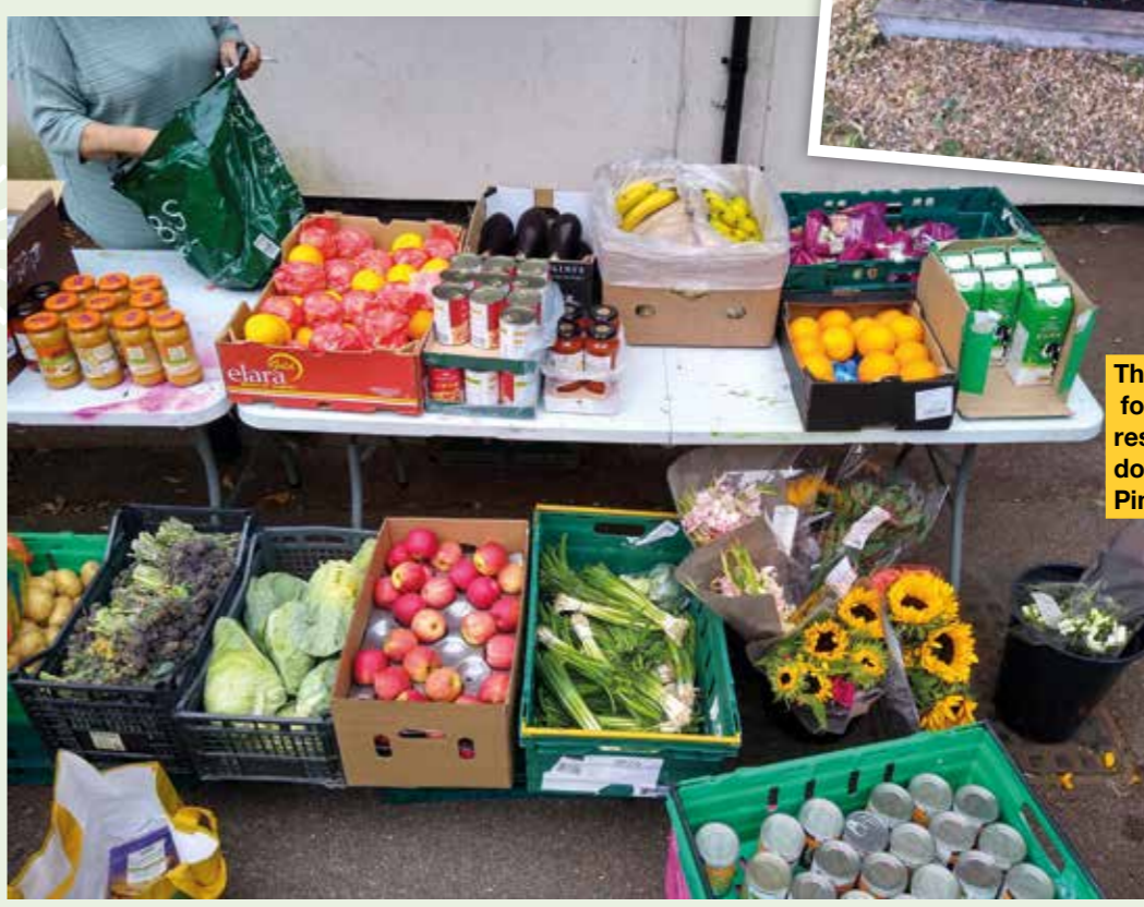
The MyYard surplus food market for residents with food donations from M&S Pinner

many over wintering insects. ■ Any green waste is being composted on site. ■ Paths and mulch are being used, sourced from locally produced wood chip from All Seasons Tree Services. ■ The raised beds and paths are lined with cardboard as weed control, using cardboard from the food surplus collections. ■ Repaired guttering on garages to collect the rainwater. This is vital for the pond and watering plants. ■ An amazing raised-bed has been donated by a resident and this has been planted with plants purchased by Karen ■ MyYard funded a trip to go badger watching with Hazeldene residents. Altogether, this has been an amazing community project and we hope it will develop further in the coming year. Simon Joshua, Harrow Biodiversity and Environment