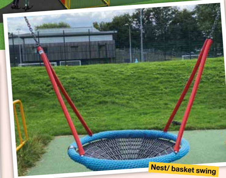
Nest/ basket swing

If anyone wants to know about the playground development info@specialneedscommunity.org.uk