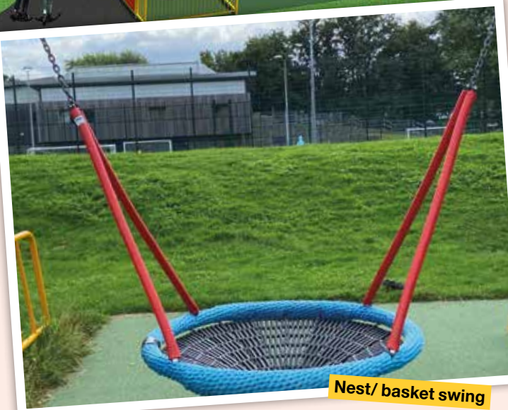
Nest/ basket swing

If anyone wants to know about the playground development ✉ info@specialneedscommunity.org.uk