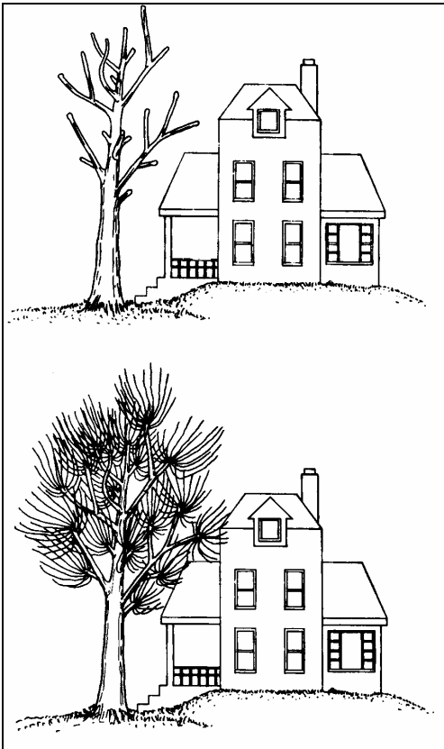
Figure 1 (top left). The tree has been disfigured after lopping and topping. Although it may be said that the tree appears 'neat & tidy', main branches have been removed creating large cuts that could very easily be infected with fungus/bacteria. Also all the leaves have been removed. Leaves are a tree's 'food factory' so their removal will have serious health consequences for the affected tree.

Professional Tree Surgeons use recognised pruning techniques (for example, crown reduction and thinning: see Appendix 1) to manage trees. Please avoid any tree surgeon that talks about lopping and topping trees. These pruning 'treatments' are not recognised by the tree care profession, they involve excessive 'pruning' and they can seriously harm trees