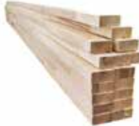
Wood and timber