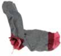
Old clothes and textiles