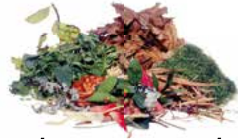
Garden waste, excluding soil