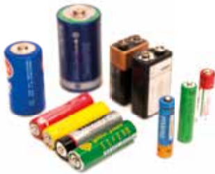
Car batteries and other batteries