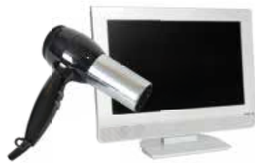
Small electrical appliances e.g. mobile phones, printers, toasters, irons, kettles, TVs and monitors