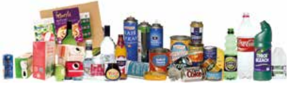
Plastic, foil, paper, card, cans and glass e.g. aerosols, bottles and boxes