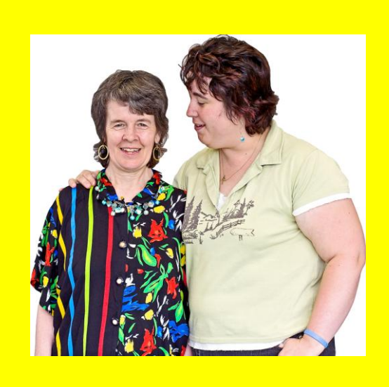
Help people to do as much as they can for themselves