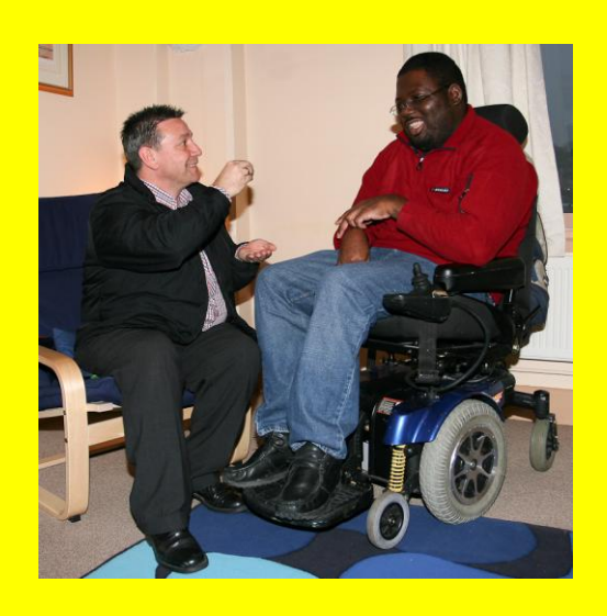
Make them feel comfortable