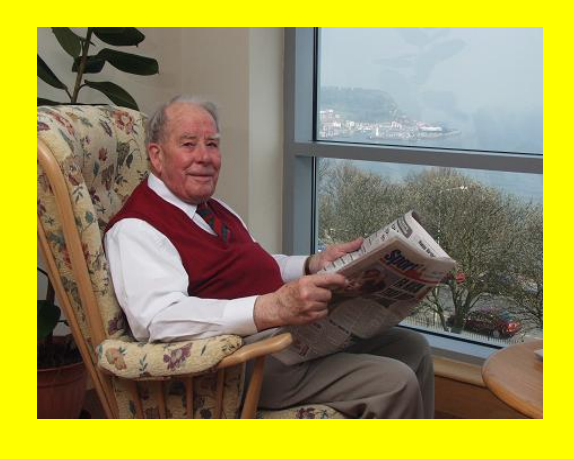
Let people be private