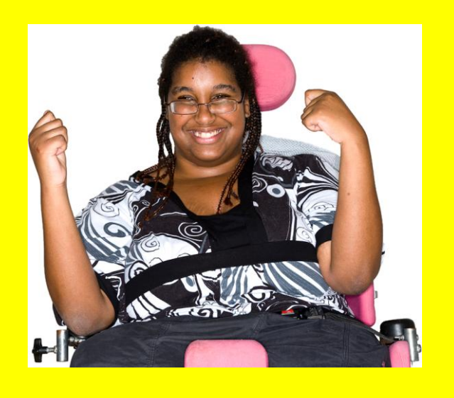
Help people to be confident