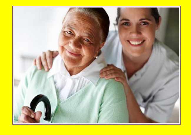
Treat people the same