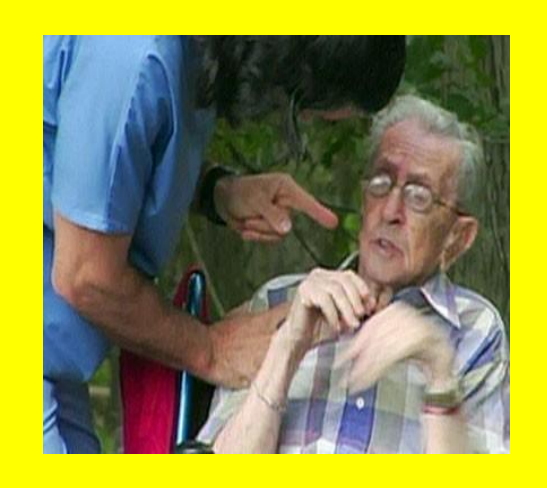
Say NO to abuse