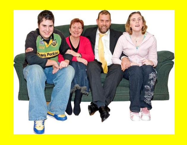
Listen to what family members and carers have to say