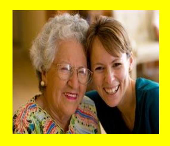
Help stop people feeling lonely