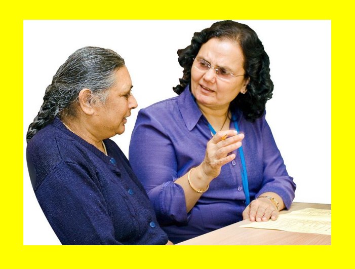
Listen to what people want and need