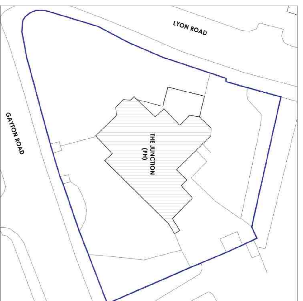
BLOCK PLAN SCALE 1:1500