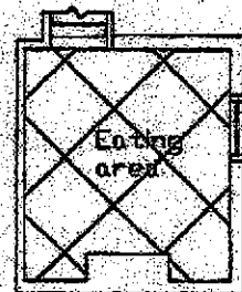
Lower ground floor plan

Alcohol consumption area's shown hatched