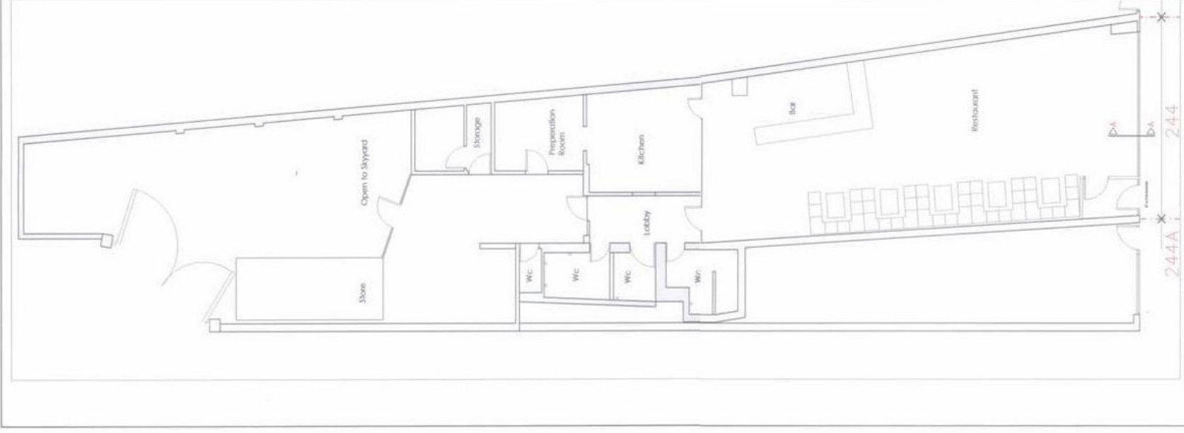
GROUND FLOOR PLAN - (EXISTING)