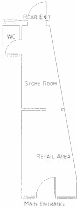
EXISTING GROUND FLOOR PLAN SCALE 1:100