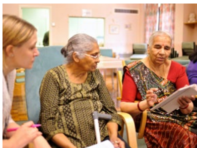
Going Digital workshop