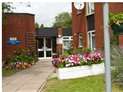
Edwin Ware Court