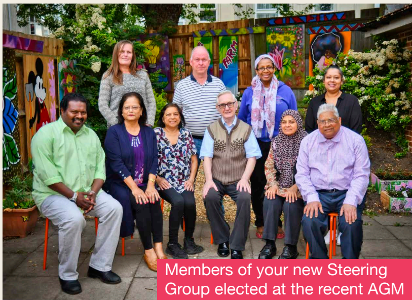
Members of your new Steering Group elected at the recent AGM