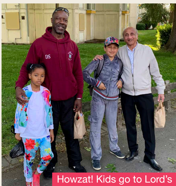
Howzat! Kids go to Lord's