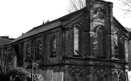
The former Harrow Welsh Congregational Church. Consult with owners to secure enhancement of windows