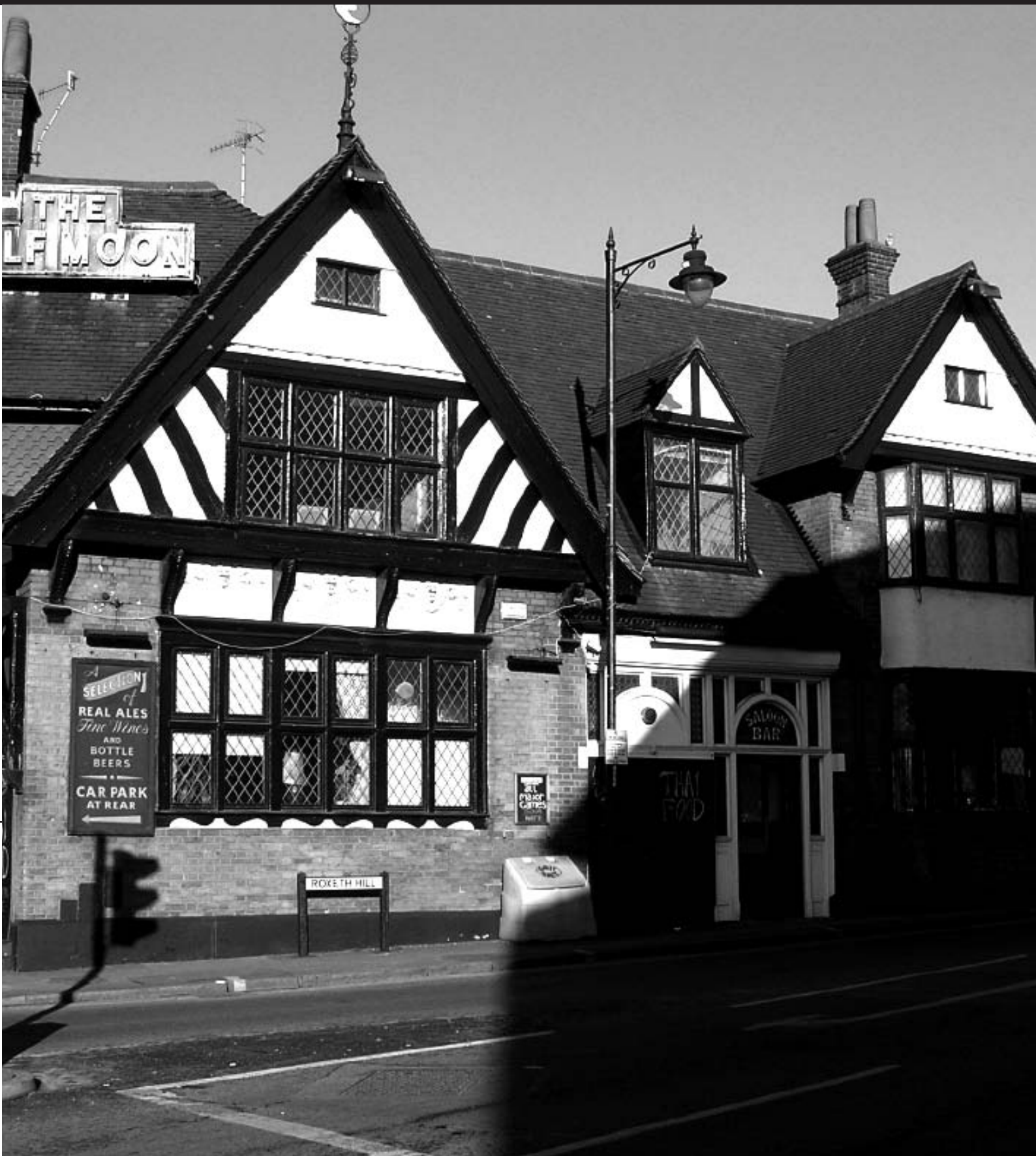
The Landmark Half Moon Public House, Roxeth Hill, rebuilt in 1893