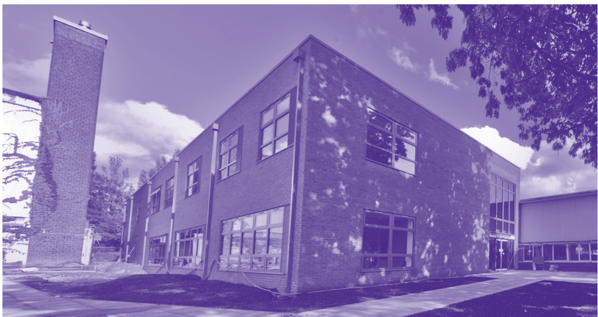
Facilities at Shaftesbury High School - Outstanding for children with Special Educational Needs'

In 2015 the Council invested almost £1m in the restoration of the Great Barn at Headstone Manor. In 2016 it was successfully opened as a wedding and function venue. We also secured Heritage Lottery funding to restore the Manor House and open it as a free public museum in November 2017. In 2015