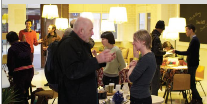
Library Lab at Willesden Green Library, London.

The idea of a pop-up space can prove useful in bringing together many different organisations, in a setting where they might not have usually partnered up in. For instance, the Library Lab in Willesden held a successful Careers Fair in association with Careers4Mums that was directed towards women and mums returning to the workplace. By hosting events such as this, or free sessions for entrepreneurs, a younger audience of residents looking to develop their careers can be reached. Feedback has been hugely positive, with one entrepreneur commenting that they "got so much feedback and help going to def[initely] stay posted" .