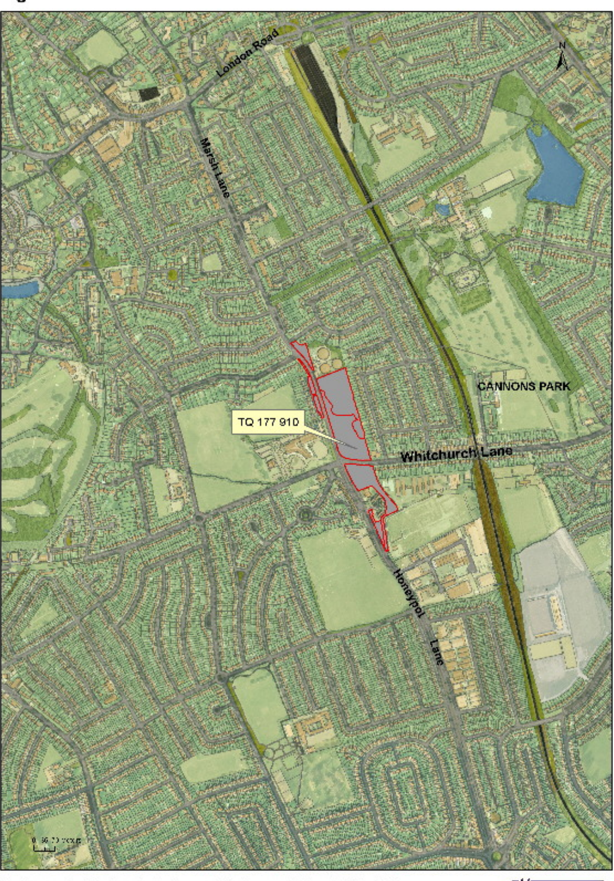
Figure 1: Location