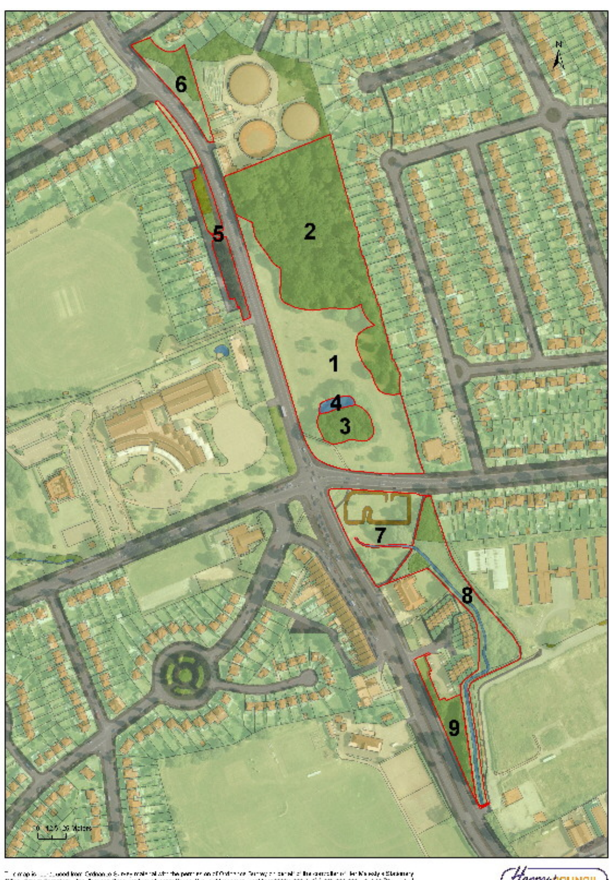
Figure 2: Compartments