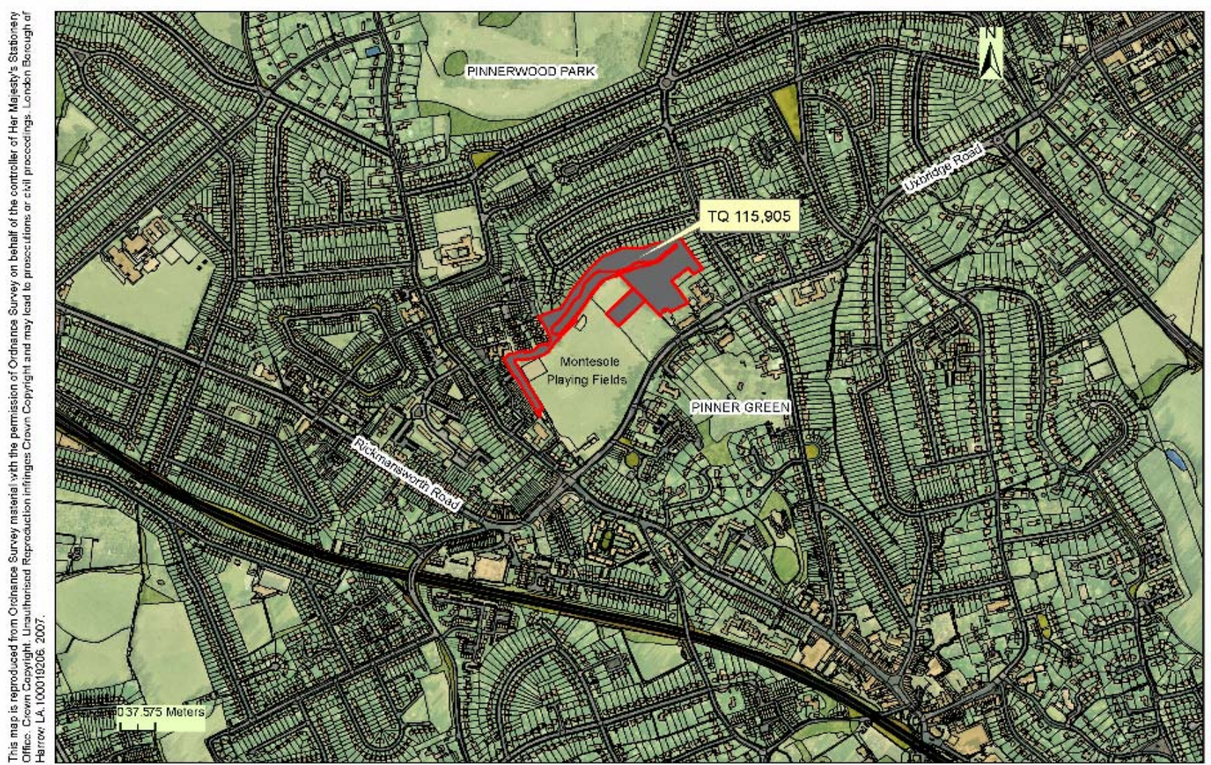
Figure 1: Location