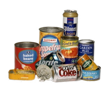
Tins and cans

Remember to wash containers before putting them in your recycling bin