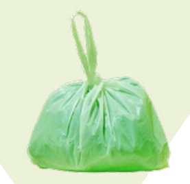
Pet waste (in plastic bags)