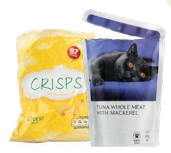
Foil packets and wrappers