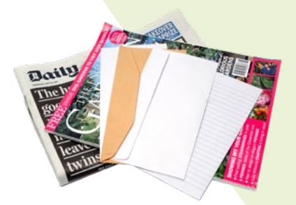
Paper and magazines