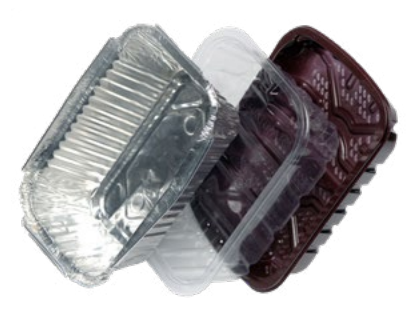
Foil and plastic containers